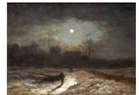
George Inness (1825-1894) Winter Moonlight/Christmas Eve, 1866 Oil on canvas 22 x 30 in. Museum purchase; Lang Acquisition Fund 1948.29