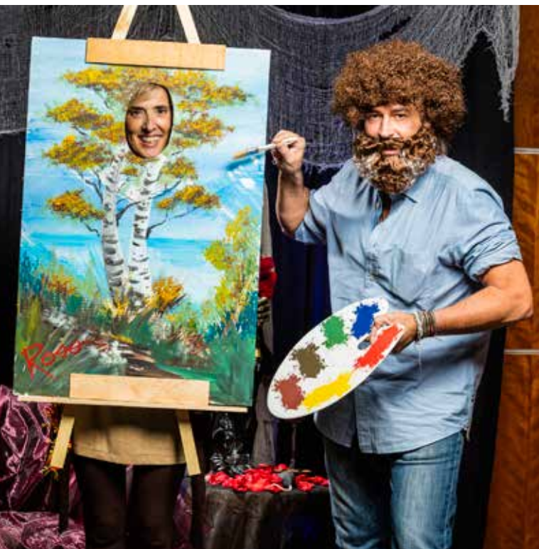
Fright Night: Top image: Dancers of the Performance Workshop Ensemble from the Sharron Miller Academy of Performing Arts; Bottom image: Attendees enjoying the Photo Booth