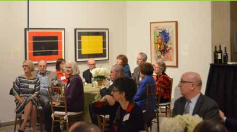
Crosscurrents: Private cocktail reception held prior to the public lecture