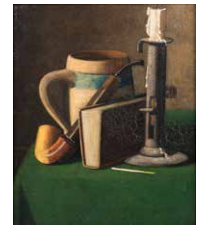
John F. Peto (1854-1907) Pipe, Mug, and Candlestick, 1880 Oil on canvas 12 x 10 in. Museum purchase; Lily Murray Jones Fund 1967.27

Charles White: A Retrospective at Art Institute of Chicago (June 8, 2018 – September 3, 2018), Museum of Modern Art (October 2, 2018 – January 13, 2019), and Los Angeles County Museum of Art (February 17, 2019 – June 9, 2019)