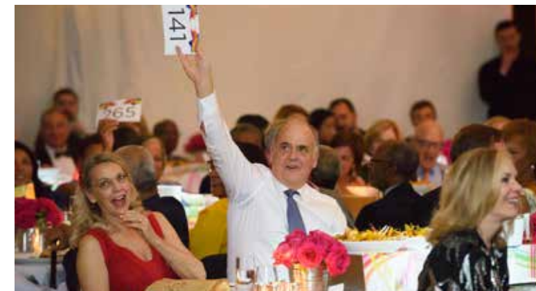
Bottom image: Spirited bidding by guests