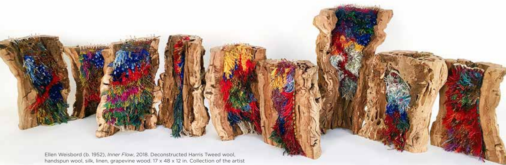
Ellen Weisbord (b. 1952), Inner Flow , 2018. Deconstructed Harris Tweed wool, handspun wool, silk, linen, grapevine wood. 17 x 48 x 12 in. Collection of the artist