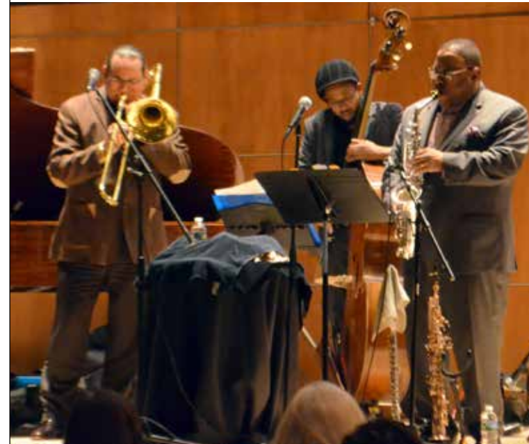
MAM After Hours: Art Meets Jazz presented the Steve Turre Quintet in partnership with MAM's African American Cultural Committee.